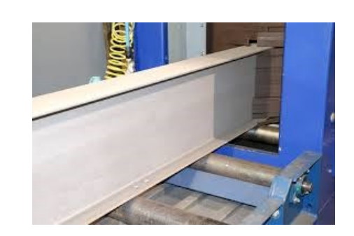
SPECIALTY—PIPE, DRUM, PLATE