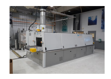
BASKET SYSTEMS—AQUEOUS AND VAPOR DEGREASING