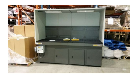
DD 3x8 Clean Air Workstation Booth